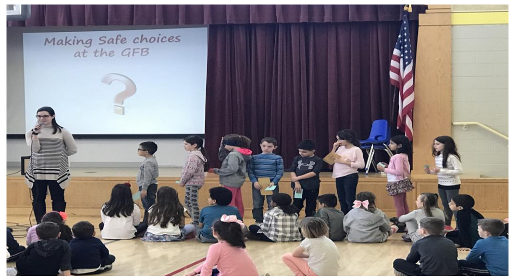
Learning safe choices from the safe choices made by others.