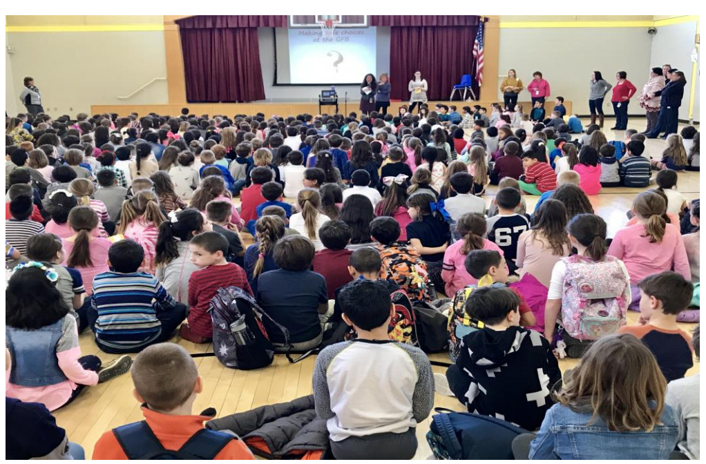
Students are showing respectful listening and trying their best during this month's SMART assembly.